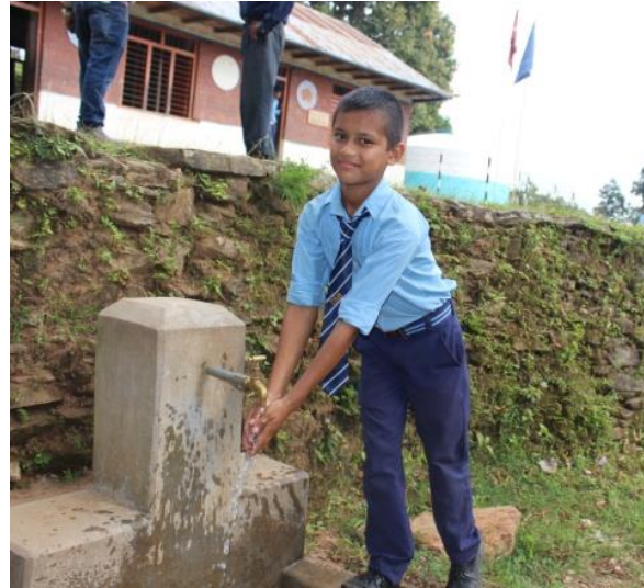
Picture 6 Water point feed from 20m3 RWH tank in Indrayani School