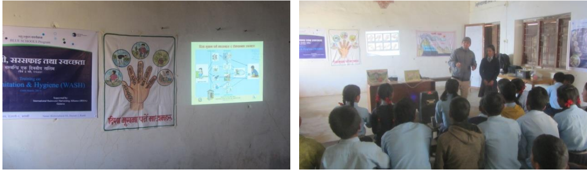
Picture 21 WASH Training at Bishwoshanti School

This WASH Training had been conducted in both of the schools. Contents were based on total sanitation and fecal transmission mode. As Kaski District has been already declared as ODF (Open Defecation Free) District communities have maintained sanitation at primary level i.e. construction of toilet. As post ODF activities Total Sanitation has been promoted to increase level understanding improved sanitation in best way. Proper use of toilet, hand washing with soap, use of quality water, food safety, household and environmental sanitation were major content used to aware the participants.