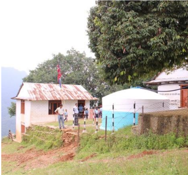
Picture 5 Indrayani School with 20m3 RWH tank with fencing