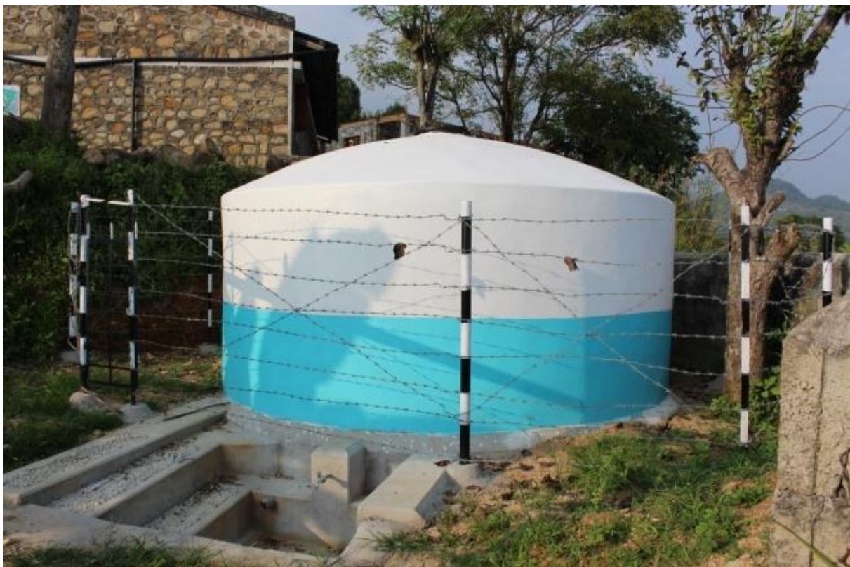
Picture 17 Water points for drinking facilities in Bishwoshanti School