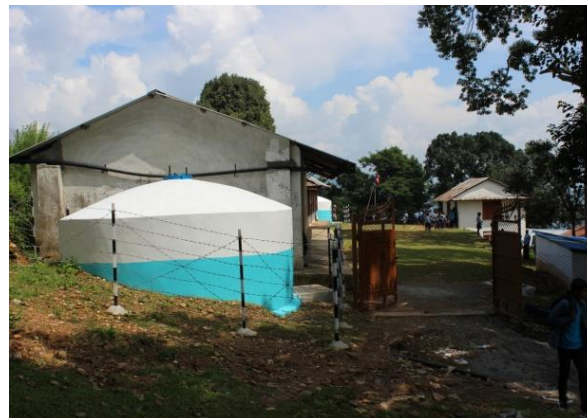
Picture 8 Improved Urinal/Toilet and New Staff toilet in Indrayani School

In 2013, when we were there, the context was far behind than now. Peon was rush to fetch water about ½ hr distance source. It was his routine to manage water supply in schools for children and teacher. He had to make such trip 3-4 times daily to provide water for drinking and sanitation facilities in 15 liter can.