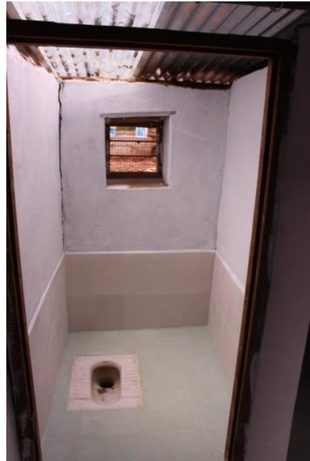
Picture 13 Repair toilet in Indrayani school