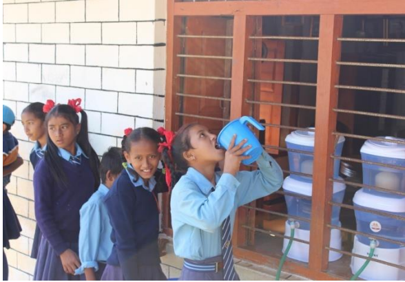
Picture 44 Girls drinking water from newly install filter in Indrayani

In schools, filters are provided for safe drinking water.