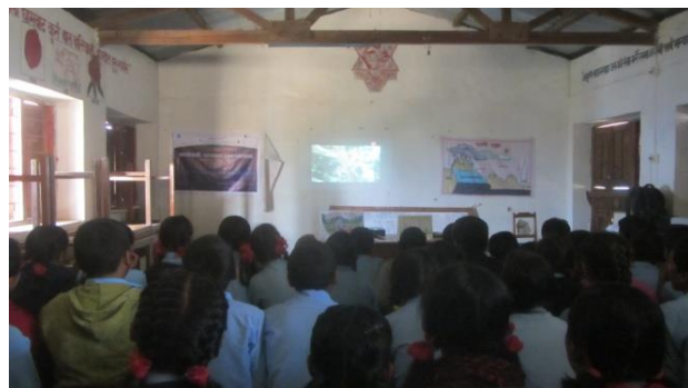
Picture 20 Documentary show in Bishwoshanti