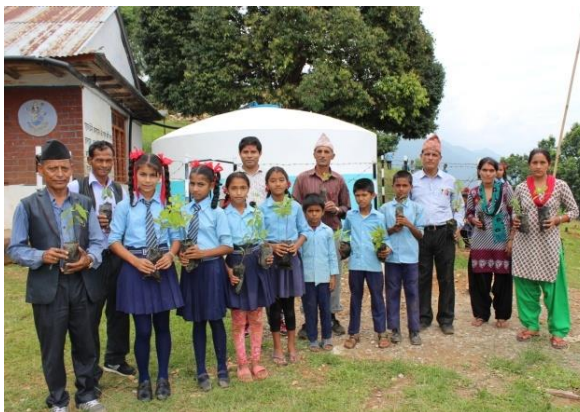
Picture 37 PACTs and Students ready for plantation at Indrayani