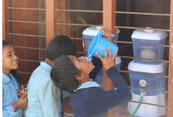
Picture 45 Boys drinking water from newly installed filter in school