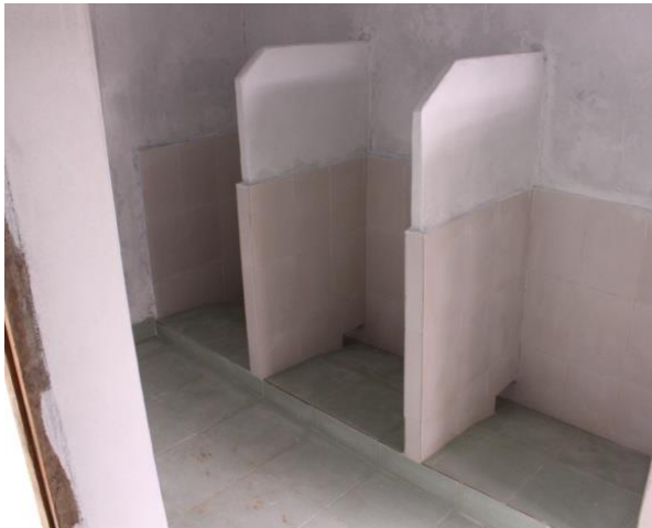
Picture 14 Improved urinal in Indrayani school