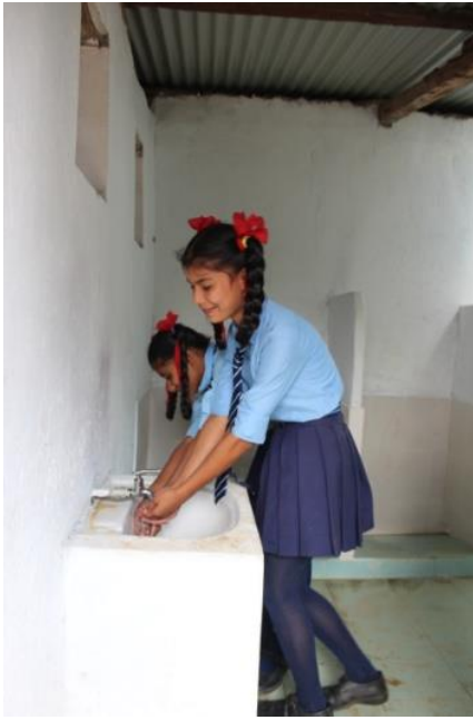
Picture 12 Girls using handwashing facilities in Indrayani School