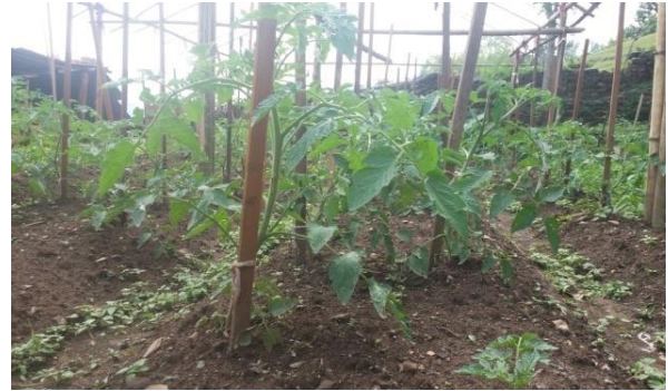
Picture 29 Tomatoes at poly house after few weeks