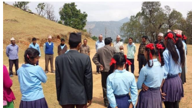
Picture 23 Activities done during Peace and Tolerance in Indrayani

For Most of the participants "Peace and Tolerance", training contents were new, so that it was very much interesting for participants and facilitator. The participants provided their full time to the training and involved themselves in almost activities of the training. Facilitators covered most of the issues of the participants and contents of the training. To match the training contents and their concept with the level of participants many references were taken from our practices and cultures which made easy to understand the essence. The whole training period was accomplished discussing about School as 'Peace Zone', Social Justice, intolerant Behavior of Students, parents and Teachers each other. After that 'tolerance' had been discussed as the threshold of peace. How 'peace culture' can be enhanced? that was discussed. Participants were made practice on the Intolerant behavior for other group, dividing themselves in three component of school such as student, teacher and parents they self –assessed the Behavior and practices prevalent in the schools.