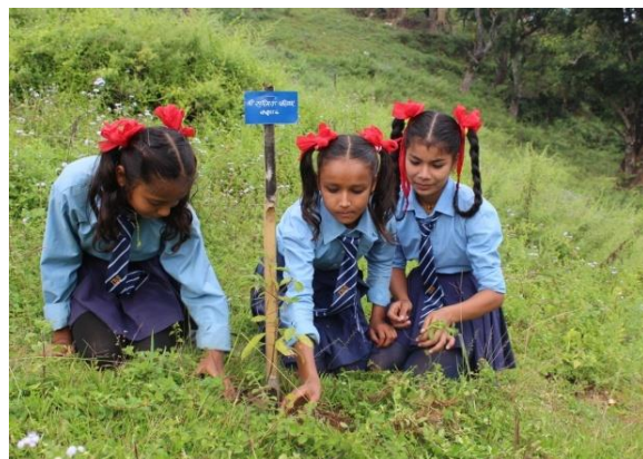
Picture 40 Students removing weeds around newly planted plant