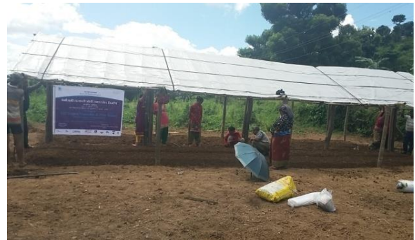
Picture 31 Poly constructed during poly house training at Bishwoshanti