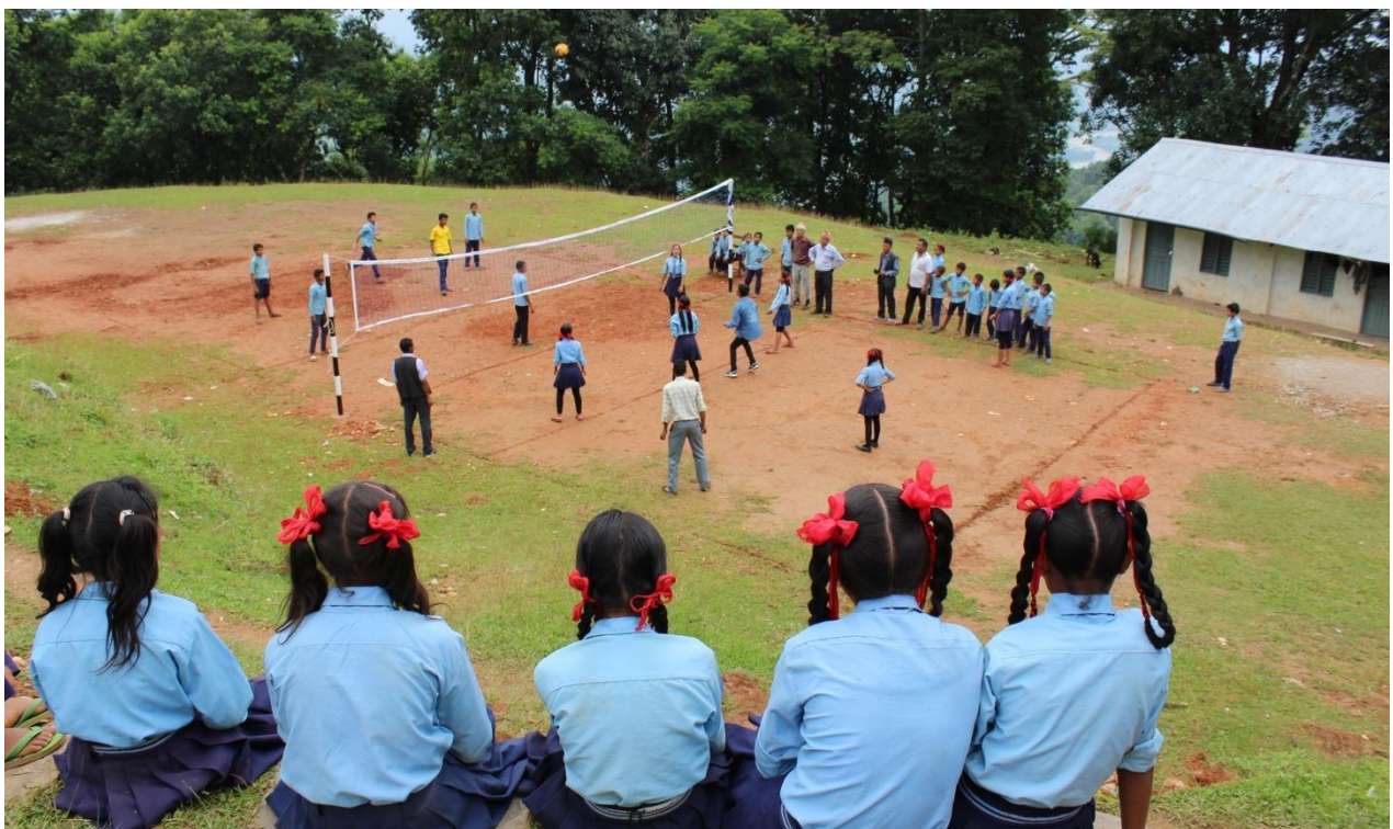
Picture 43 Girls and Boys playing volleyball in Indrayani School

Students share common ground to play volley. This was the first time that student got such opportunity to play in such environment. Girls and boys