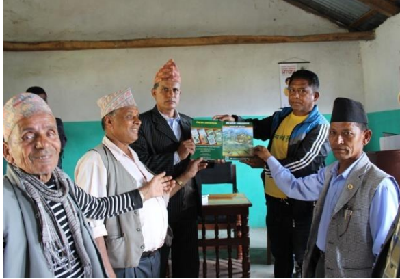
Picture 24 Handover Offseason Cultivation handbook in Indrayani