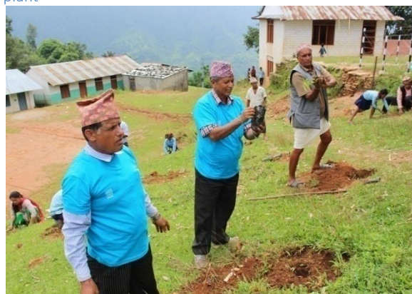
Picture 42 Local authority and Guardians take part in plantation in Indrayani