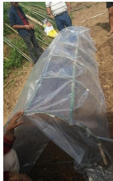
Picture 27 Covering nursery bed with plastic