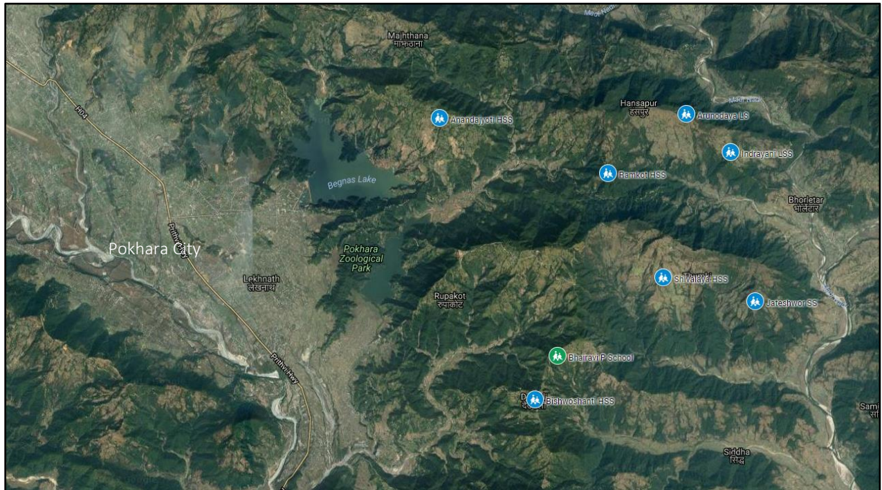
Picture 1 Blue icon in Google Map shows no. of Blue Schools in Kaski District

The project “Blue schools: Rainwater at the heart of rural communities in Nepal” based on the assessment conducted, the needs identified. This year in 2017, the program is implemented at two schools i.e Indrayani and Bishwoshanti School from Kaski District and later at two schools. In 2013 this Blue School Program had been successfully implement in four schools from eastern part of Kaski District and one school from Lekhnath in late 2016. Under new federal system, these 2 schools Indrayani and Bishwoshanti are located in RupaGaunpalika, Kaski.