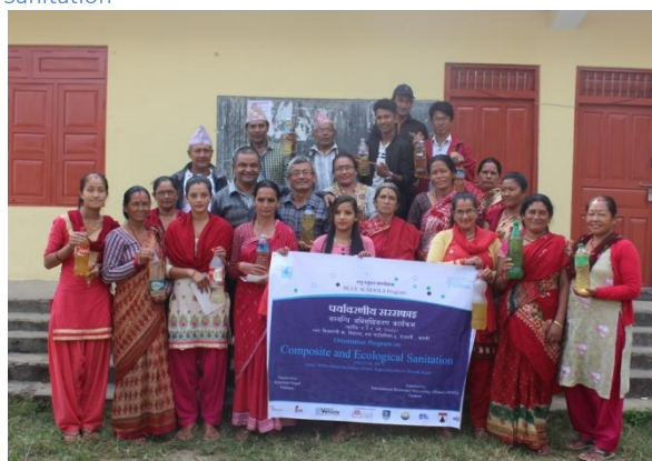
Picture 35 Group photo with urine in participant hands at Bishwoshanti