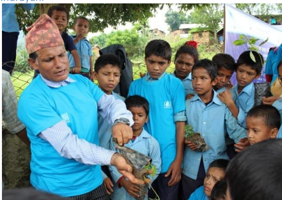
Picture 39 Demonstration during plantation