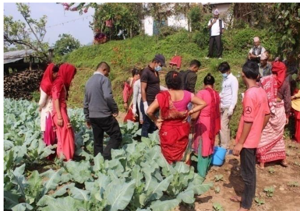
Picture 33 Practical Session in Bishwoshanti of Ecological Sanitation