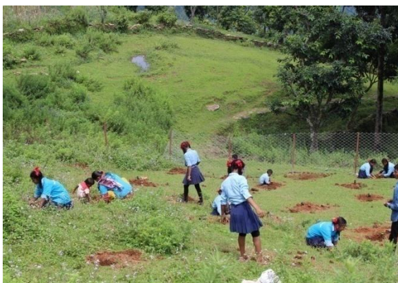
Picture 41 Students busy in plantation