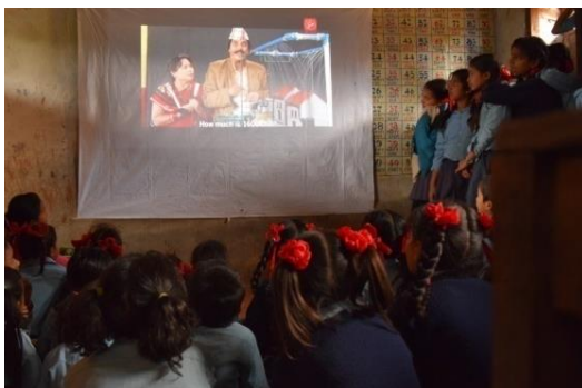
Picture 19 Documentary show in Indrayani

Tele-film 'Jalpari' (Water Angel) show on Rainwater Harvesting casting by Nepal's popular comedian artist in both Indrayani and Bishwoshanti School.