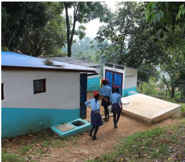
Picture 7 Another 20m3 RWH tank connected to sanitation facilities in Indrayani School