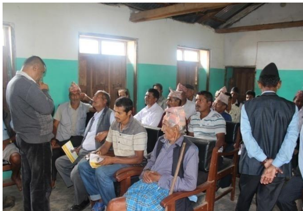
Picture 32 Resource Person during indoor session of Ecological Sanitation Training