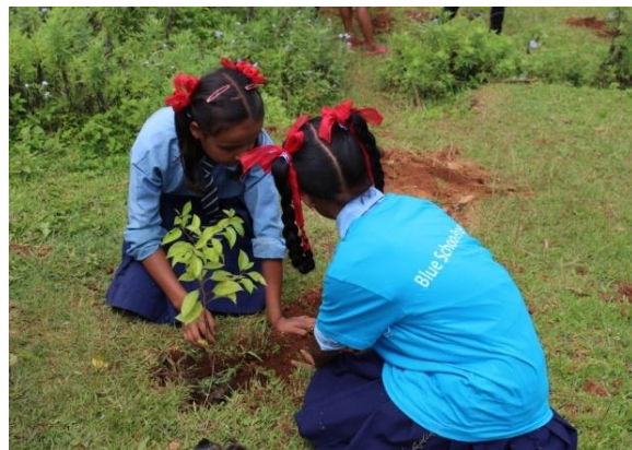
Picture 38 Girls helping each other during plantation