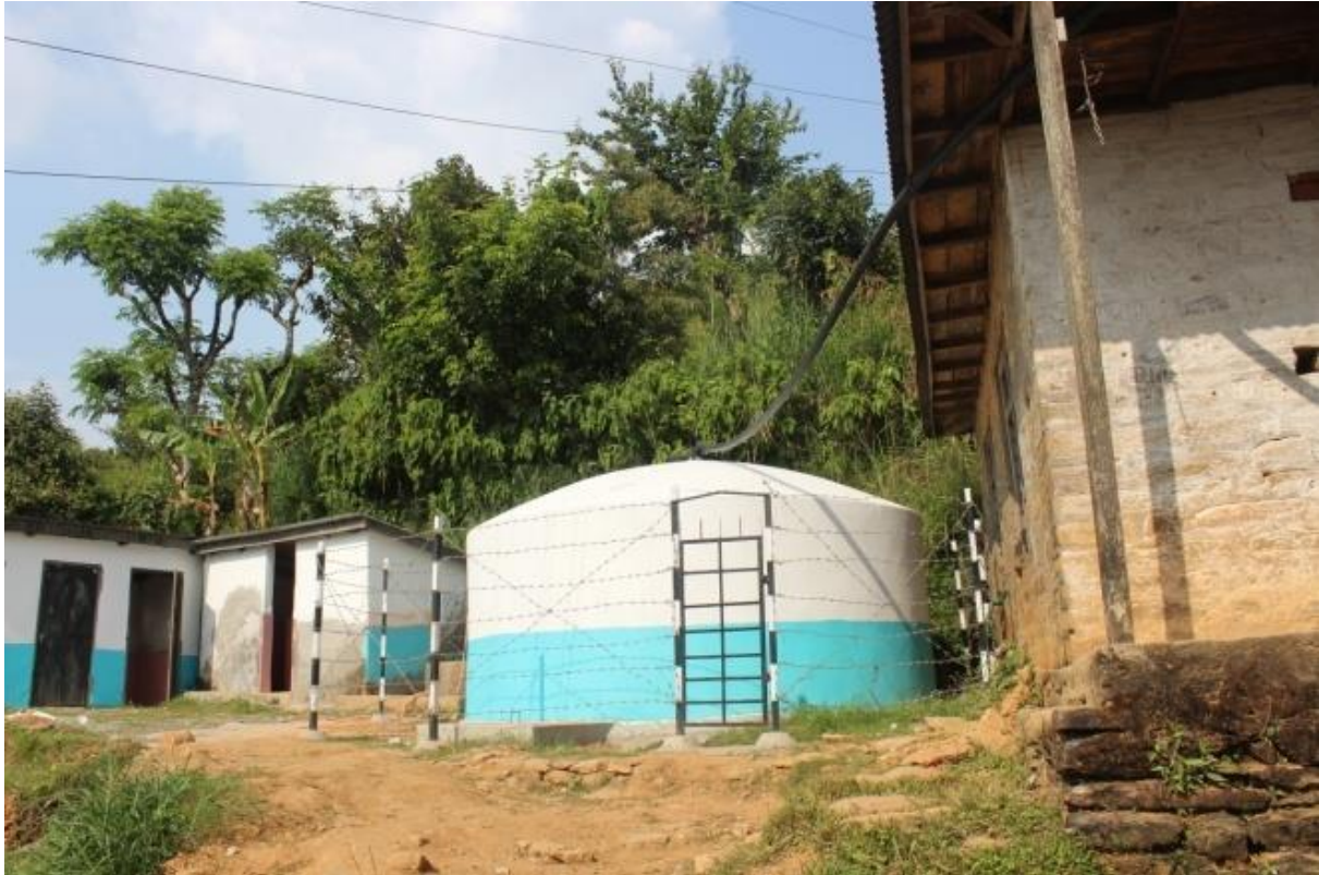
Picture 18 2nd 20-m 3 RWH tank for sanitation facilities in Bishwoshanti School

Due to huge request from nearby School and community, one tank from Bishwoshanti was shifted to this Bharavi School.