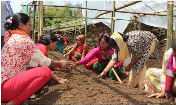
Picture 28 Practical session of poly house in Indrayani School