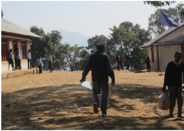
Picture 9 Peon of School carrying water vessel to fetch water from distance source (2013)