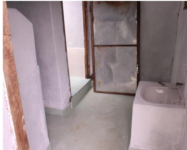
Picture 15 Handwashing facility inside Toilet/Urinal block in Indrayani School