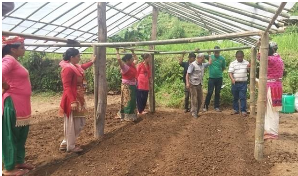
Picture 30 Participants during polyhouse training at Bishwoshanti