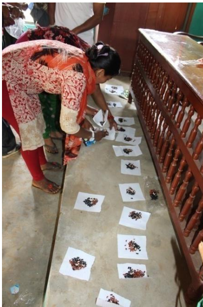
Picture 26 Seed distribution among participants