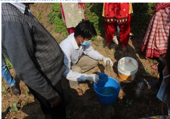
Picture 34 Demonstration of Urine application