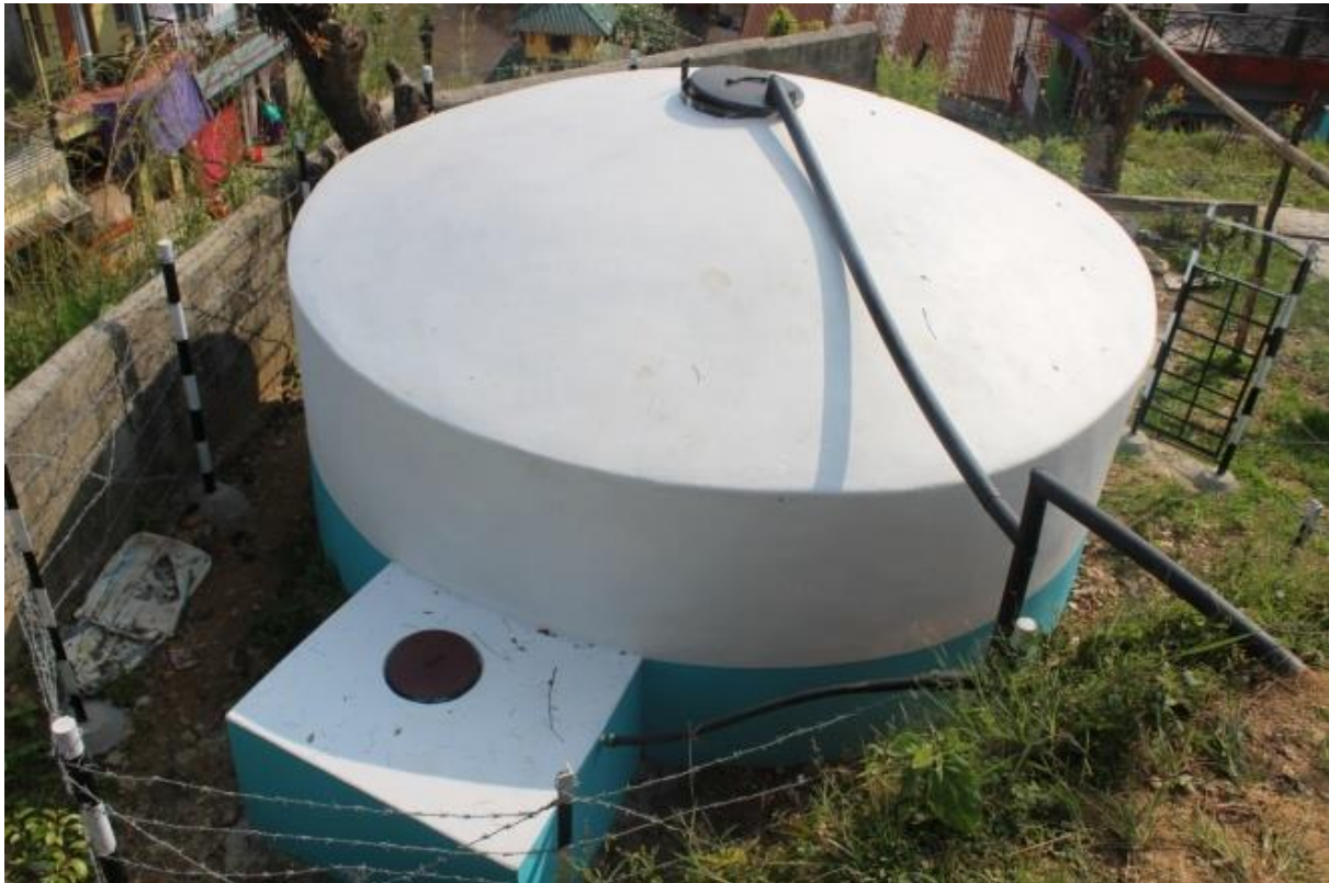
Picture 16 20m 3 RWH Tank in Bishwoshanti School with auto flush system